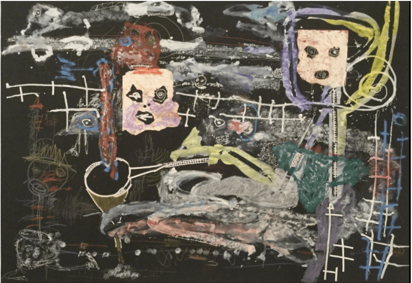
Thierry Oussou, Untitled (2016), Courtesy of the artist and Tiwani Contemporary.

Youssef Limoud. Kitso Lynn Lelliott's intimate and poetic video piece, I was her and she was me and those we might become (2016), engages in a reflection on non-linear time. In the work, distant timelines come together in fragmented and mutable constellations. The artist underlines the impossibility for a valid historical narration, personal or collective, to come as a single, immutable object of knowledge. History is the result of a continuous interweaving of plural and dissonant accounts. It is an irreducible complex of traces, impressions and dreams.