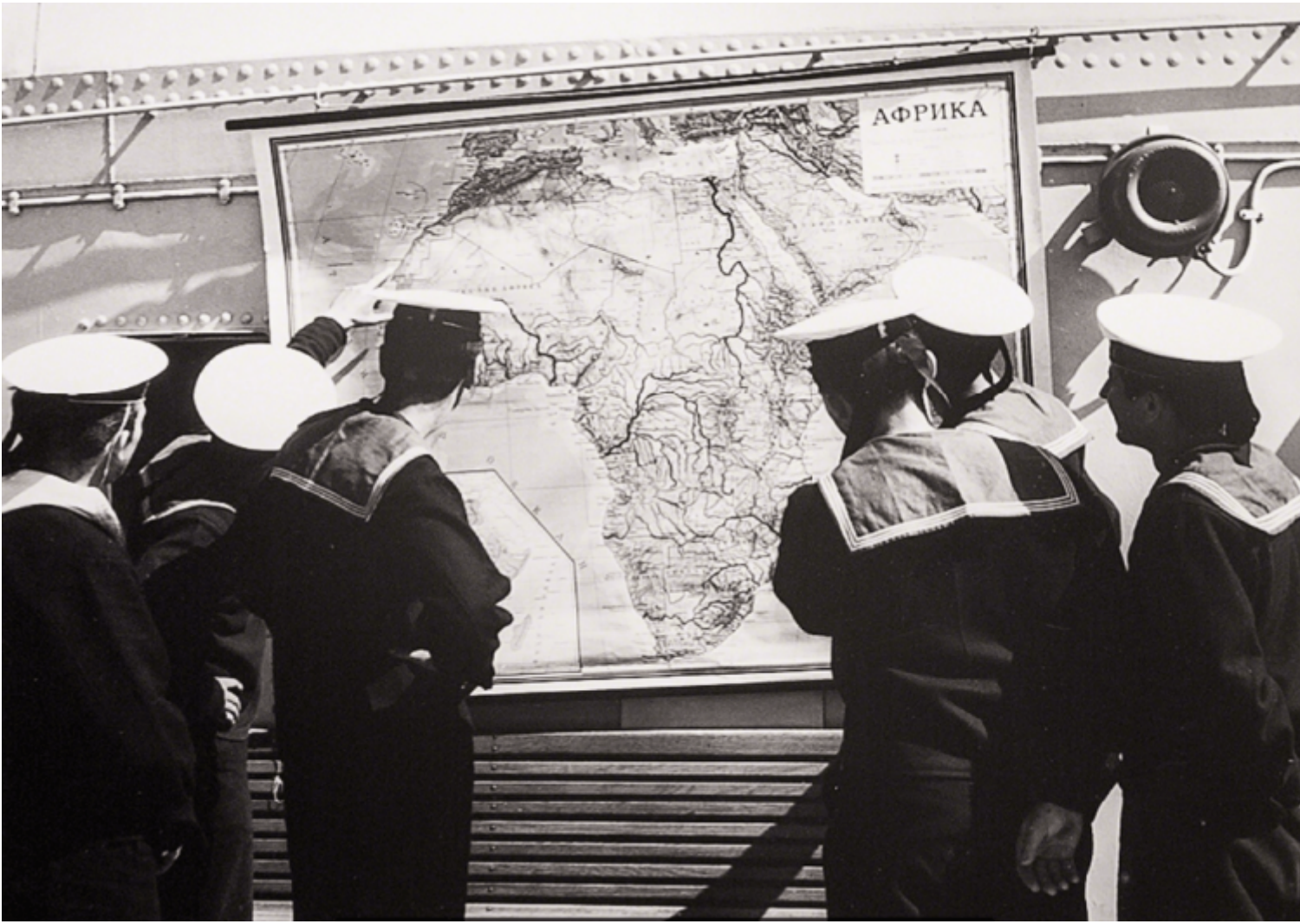
Theo Eshetu, The Mystery of History and My Story in His Story (2015), Courtesy of the artist and Tiwani Contemporary.

The London art gallery Tiwani Contemporary is currently showing Field Work , a collective exhibition featuring eight artists from Africa and diaspora “who have anchored their practice in a deep examination of the mechanics of history”, as the press release states. Browsing the fairly small space of the gallery, the visitor will in fact face eight distinct and very peculiar approaches to questions of time and history telling. The chosen artworks bring to light alternative ways of recording, recovering and study the many forms of the past, while challenging dominant Western-centric historiography. Each of the pieces is expression of much more complex artistic researches that can, in some cases, reveal relevant connections in terms of methodology and underlying point of interests.