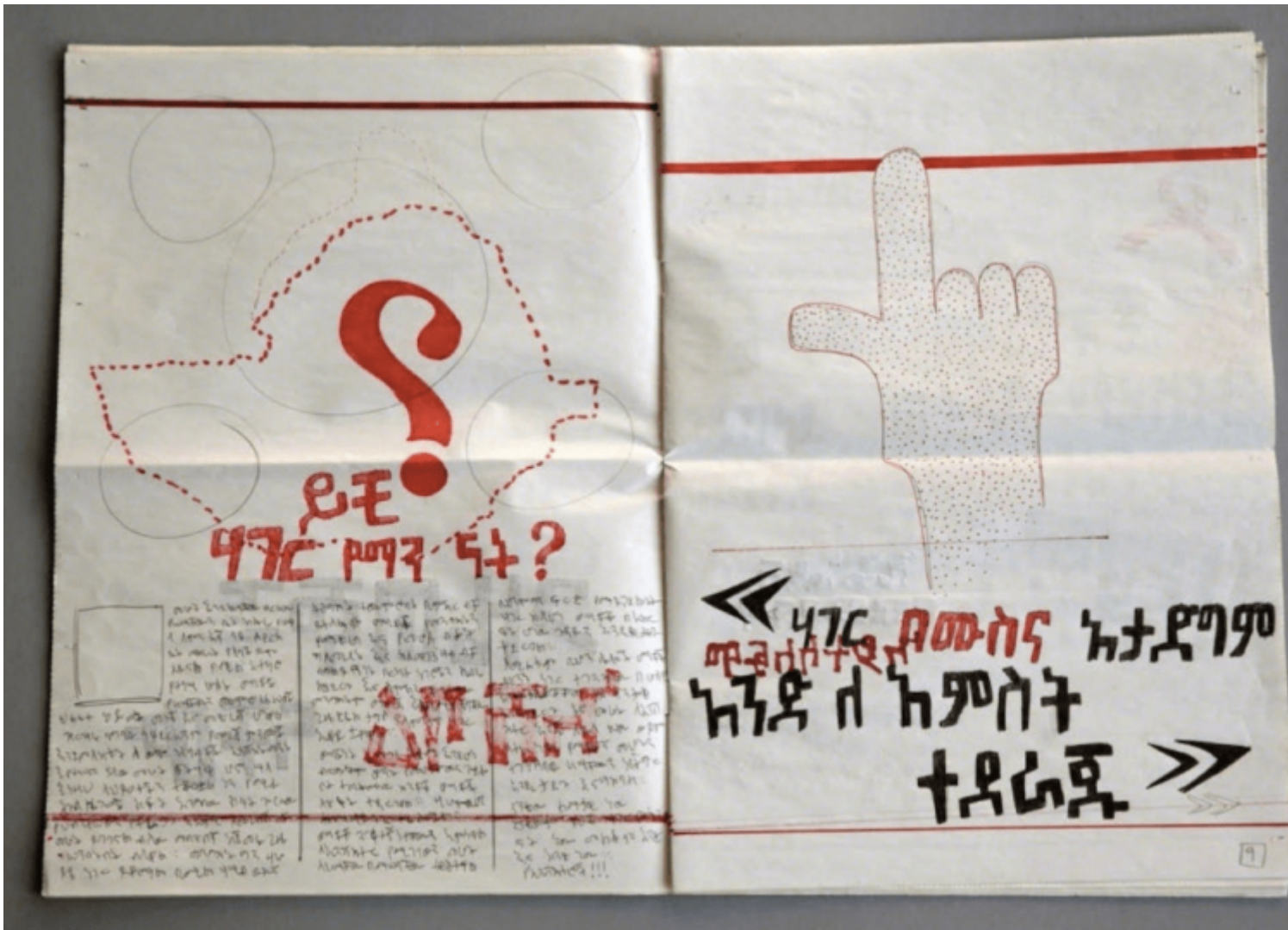
Robert Temesgen, Another Old News (2016), Courtesy of the artist and Tiwani Contemporary.