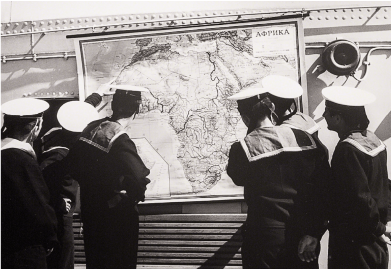
Theo Eshetu, The Mystery of History and My Story in His Story (2015), Courtesy of the artist and Tiwani Contemporary.

The London art gallery Tiwani Contemporary is currently showing Field Work , a collective exhibition featuring eight artists from Africa and diaspora “who have anchored their practice in a deep examination of the mechanics of history”, as the press release states. Browsing the fairly small space of the gallery, the visitor will in fact face eight distinct and very peculiar approaches to questions of time and history telling. The chosen artworks bring to light alternative ways of recording, recovering and study the many forms of the past, while challenging dominant Western-centric historiography. Each of the pieces is expression of much more complex artistic researches that can, in some cases, reveal relevant connections in terms of methodology and underlying point of interests.