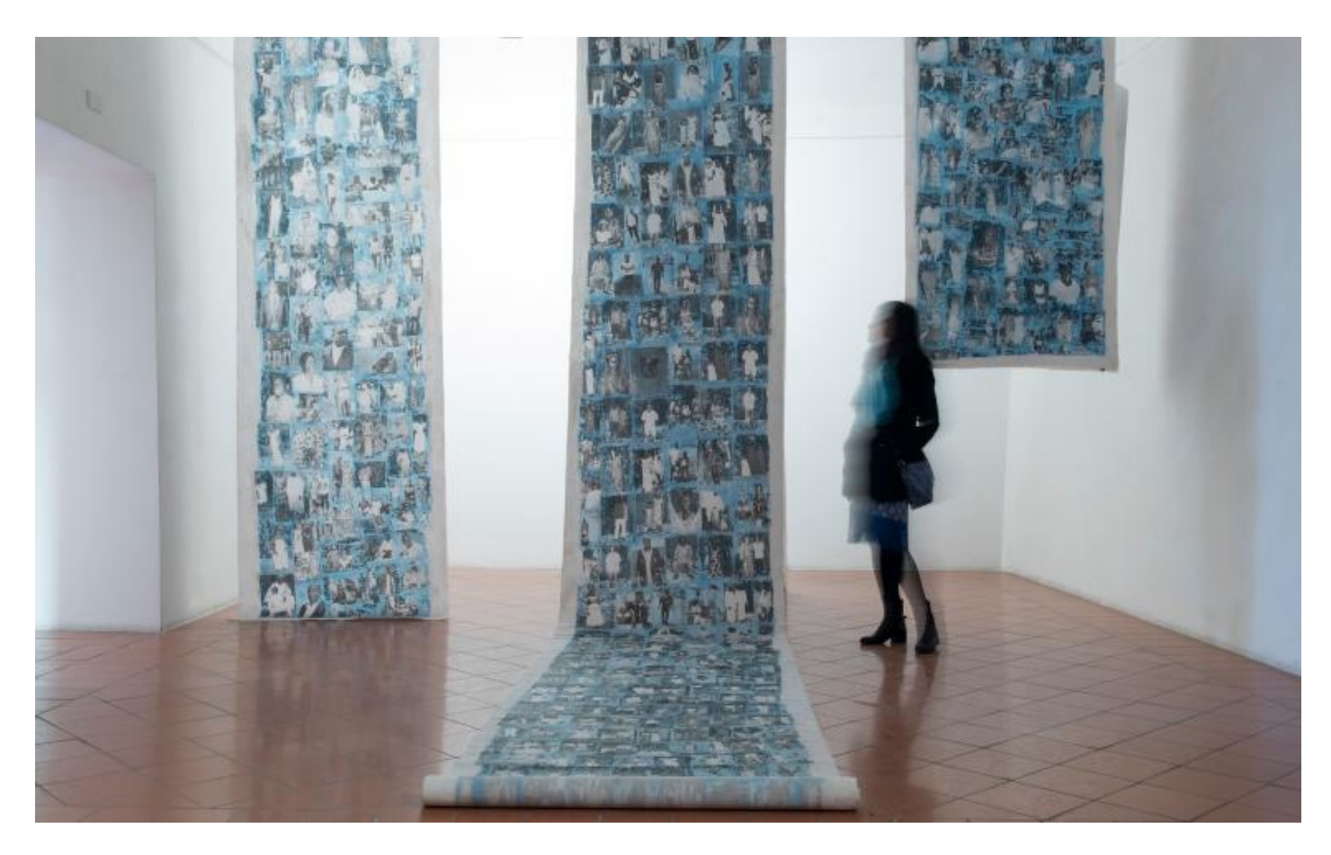
Ph: Virginia Ryan, Installation view, Palazzo Lucarini 2017, courtesy of the artist.

Her penchant for assemblage and photomontage, for found objects, for perishable and recycled materials, opens up a dialogue with the history of art, but arises from a personal need, from her experiences in Africa. Faced with the wounds and transience of life, with the passing of time that encompasses and erases everything, Virginia Ryan gives life to meticulous assemblages of materials, patchworks where stitch marks are not concealed: an art of memory that alters its object by ripping or erasing it.