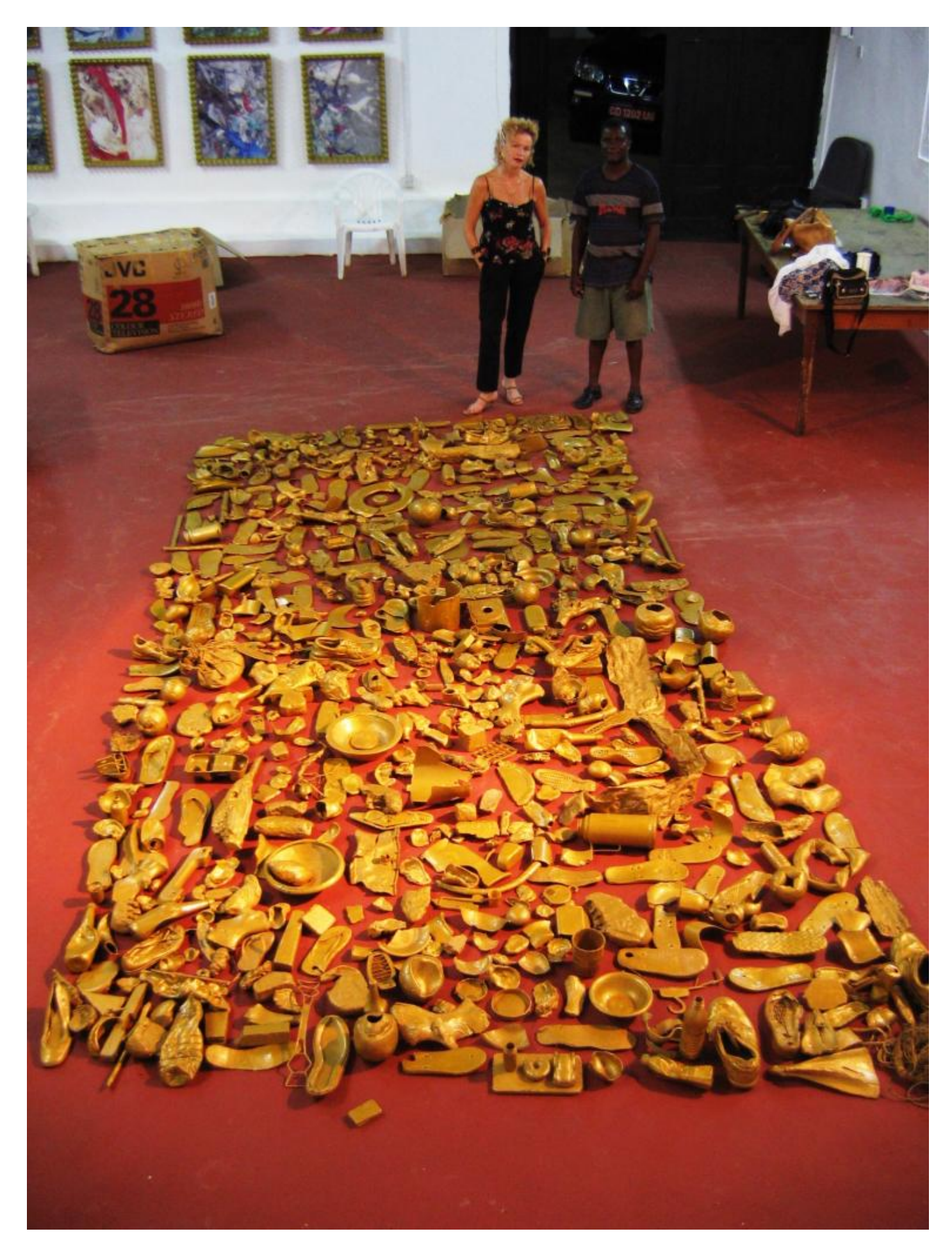
Ph: Virginia Ryan, Goldfield, Kumasi 2002, courtesy of the artist.