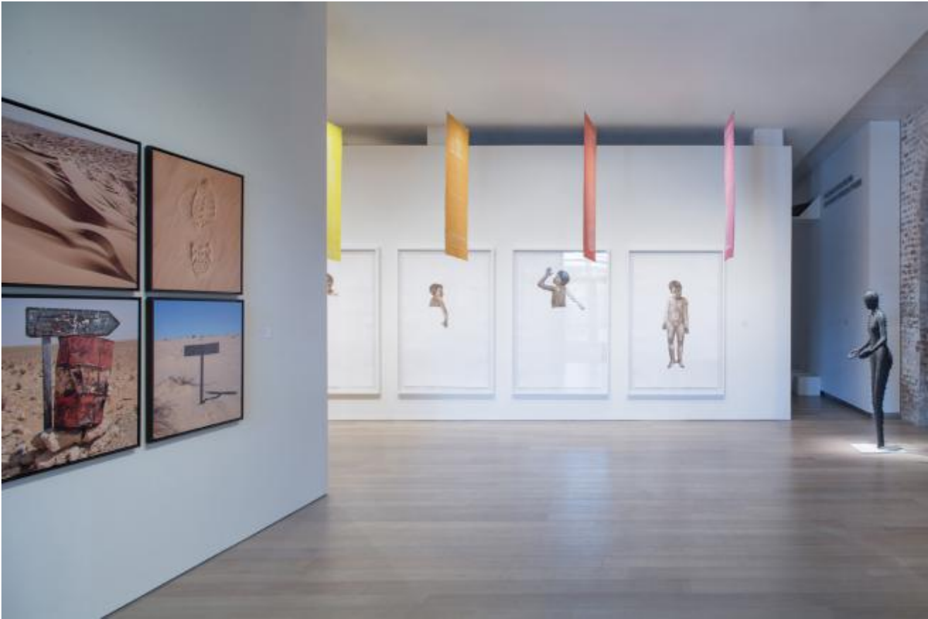
The Divine Comedy, exhibition view

an essay by Roberto Casati. We are now back to explore it through a series of interviews by some of the exhibition's artists, done by Contemporary And (C&) , the online art magazine with the focus on contemporary art from African perspectives, during the premier at MMK in Frankfurt and generously offered to us for republication. We have selected some of the artists' answers to build a journey through the subjective and multifaceted points of view of each artist that had to confront Dante's masterpiece. It's a collective tale of the project and its complexity, a project that mixes worlds and perceptions, moving through countries and cultures, the individual and the collective.