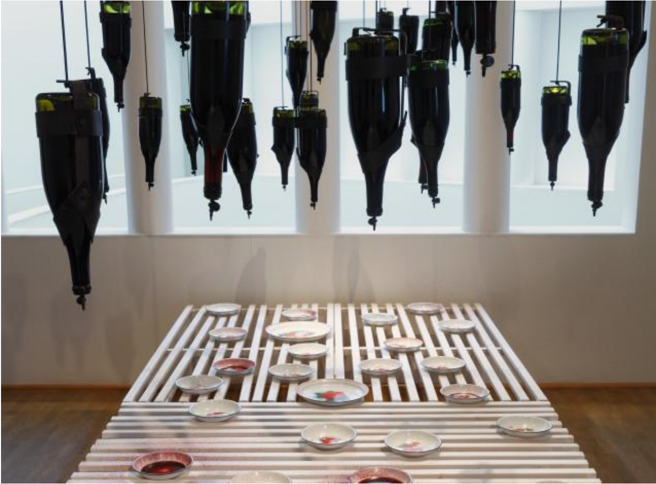
Wangechi Mutu, Metha , 2010

here, the living dead are the people who have died but retain a certain amount of power amongst us because they've just died. But mostly, the reason why they retain power is because the living dead are the people who are dead and who we still remember, the ones we pray to, or are still in touch with. They are living dead – they are still amongst the 'alive'. So the 'living dead' is probably my favorite. I think that my work lives in that realm if anything – not the after life, it's the life, right after-life.