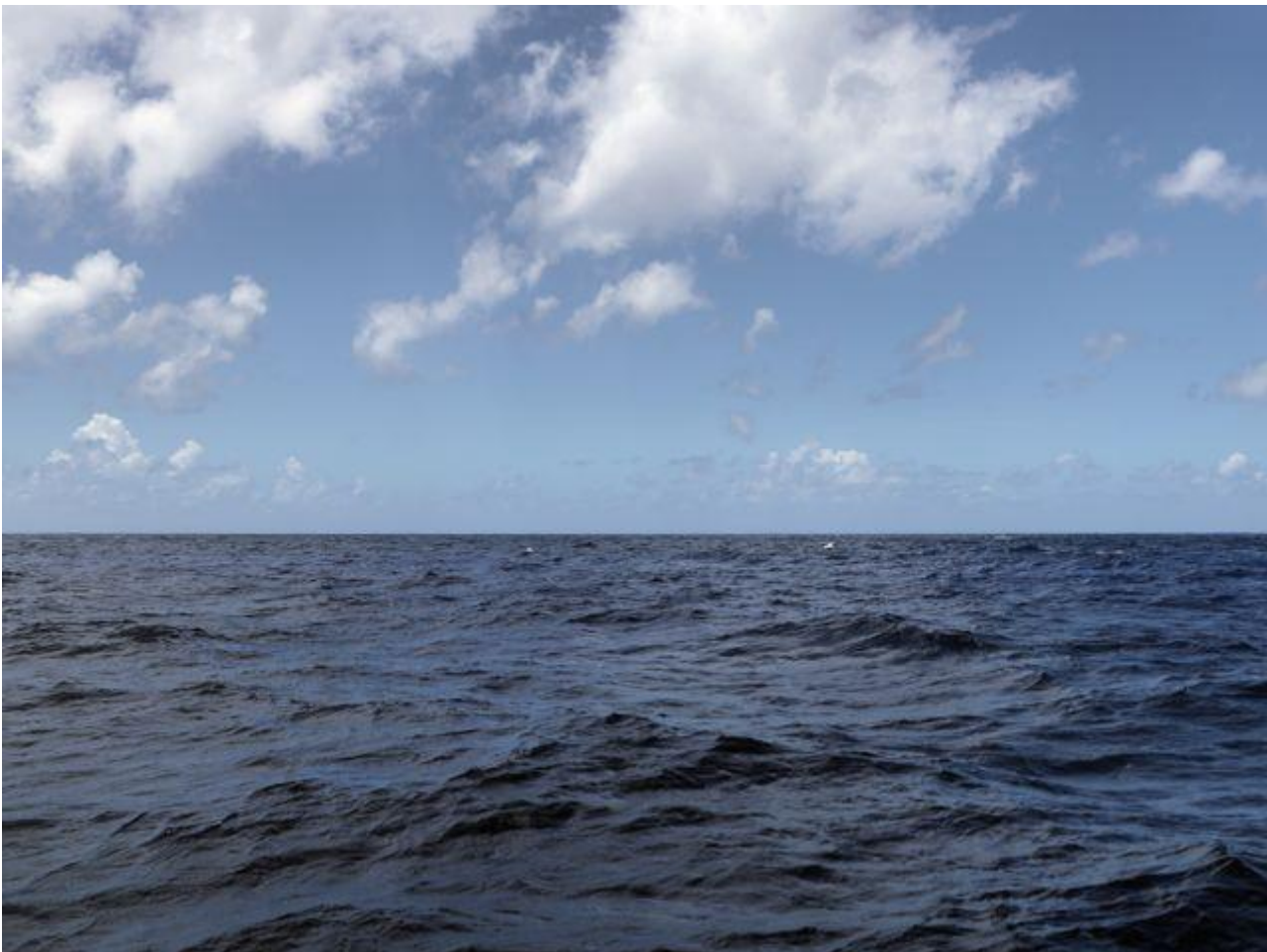
Guy Tillim, Near Huahine, 2011

Guy Tillim: I have some ideas about my practice and find echoes in Dante's poem through my experience with the camera that is informed by some self-reflection and contributes to a kind of revelation in this way: the scene in front of me speaks through me, or at least I should aspire to this state. The invisibility of self is desirable in what is mediated.