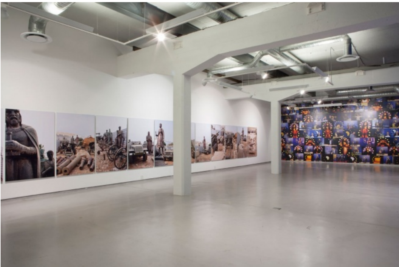
View of the exhibition (2014) KILUANJI KIA HENDA As god wants and the devil likes it