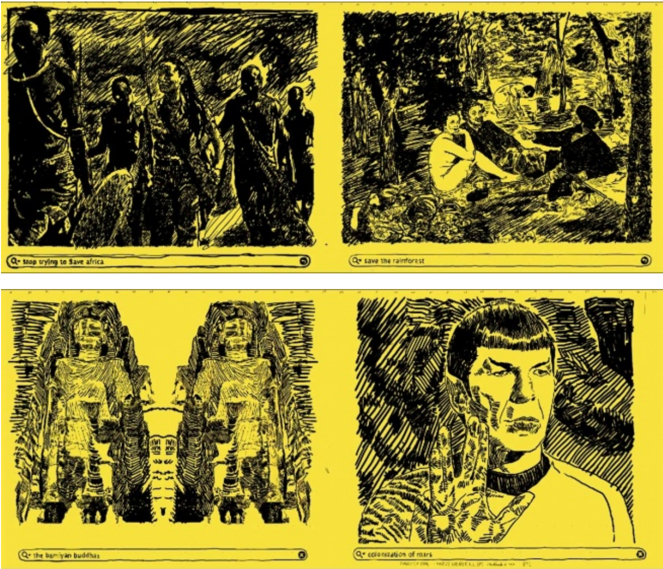
Francisco Vidal. Post-it series, 2010. Courtesy of the artist

Despite the infancy of these projects, events like these do serve to reinforce, as RitaGT alludes to in our interview , that the general sentiment is that in Angola, “potential is not lacking.” And, as the architects of emerging discourse, it is hoped that the success of these critical young artists-locally and further abroad-will translate into tangible local initiatives that lead to vitality, increased cultural awareness, and potentially, local institutional support for the arts.