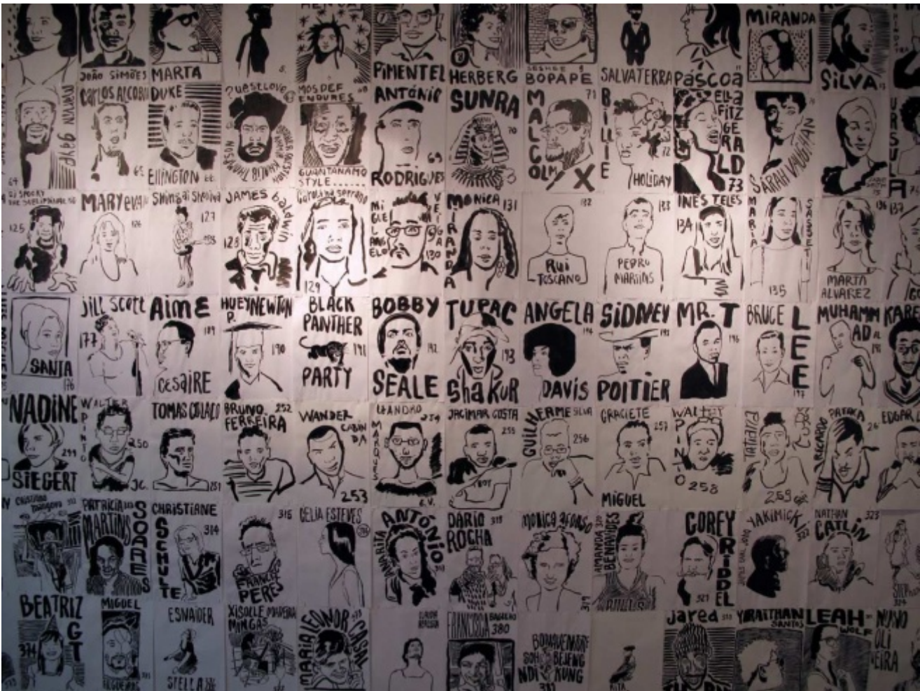
Francisco Vidal. Installation view. Courtesy of the artist

Vidal operates a multi-disciplinary practice that includes drawing, sculpture and installation as a means to reflect upon the reality in which he lives. He has a vested interest in exploring notions of race, difference, negritude and the African Diaspora.