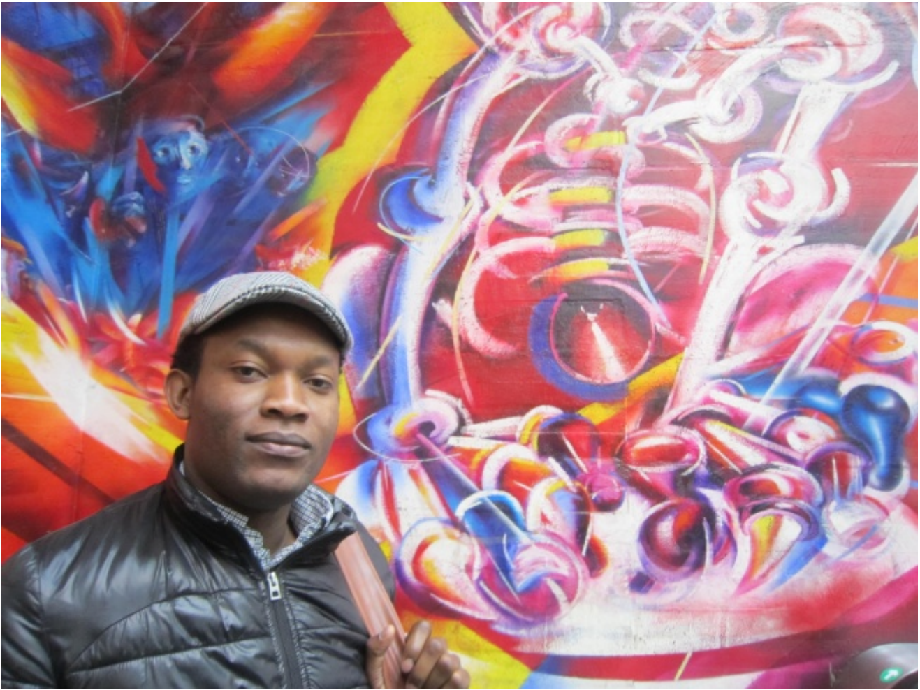
Fiston Mwanza Mujila