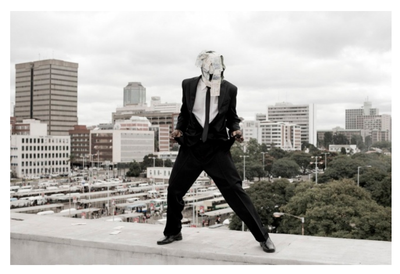
Gerald Machona, Ita Kuti Kunaye II (Make It Rain II) 2010.

Machona, who is represented by <u>Goodman Gallery</u> in South Africa, is known for his use of currencyespecially decommissioned Zimbabwean Dollars- as an aesthetic material, emphasising the recent migration of Zimbabweans following the country's economic and political collapse. Utilising a multidisciplinary approach to artistic practice, which includes performance, sculpture and film, his work addresses issues not limited to but including migration, social interaction and South Africa's recent Xenophobic violence.